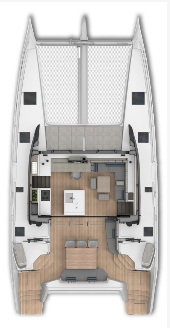
Visuals not contractual