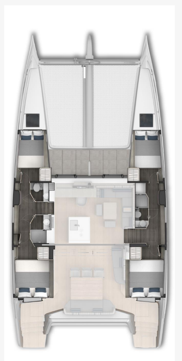
Visuals not contractual