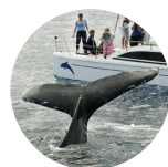
Whale & dolphin watching

The Seawind 1160 Resort is tailored to the needs of commercial operators who require a safe, cost effective yacht which also provides maximum comfort for guests. Ideal for dive operators, whale and dolphin watching, or simply taking tourists to explore coral reefs and sheltered sandy bays. The Seawind 1160 Resort is built to last, while being stylish and comfortable - completely reinventing the day charter concept. This yacht will add a new dimension to your business with the aim of retaining guests year after year.