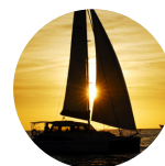
Lunch & sunset cruises