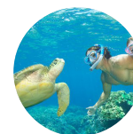
Dive & snorkel